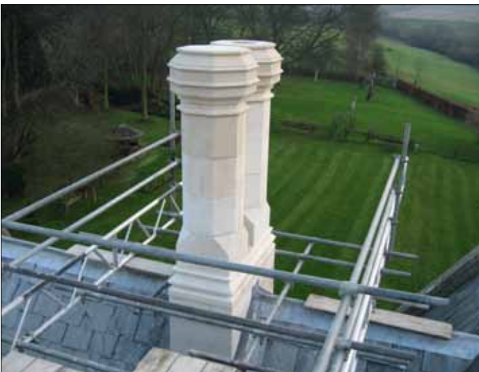
▲ The ornamental masonry chimneys were completely replaced on this old vicarage.