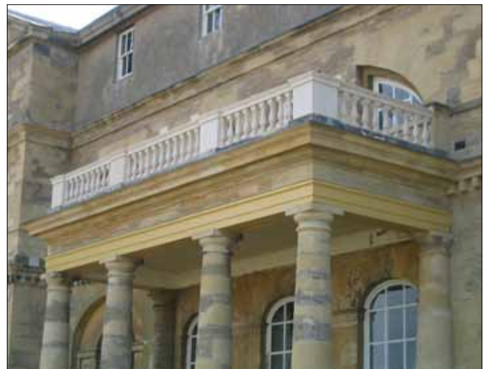
▲ Old Hall Balcony repairs